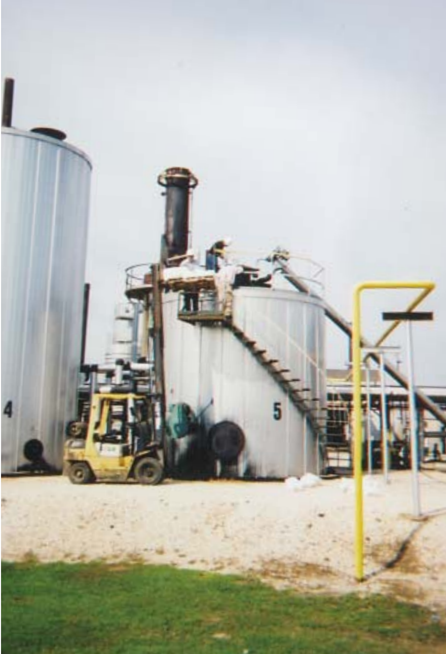
Gulf Coast Asphalt, Mobile, Ala., manufactured the PG76-22 by dispersing 1.5 percent Elvaloy RET pellets into a PG64-22 base asphalt binder in a blend tank.

be added to an asphalt binder. It is designed to stiffen the asphalt binder and improve its elastomeric properties. A terpolymer is a polymer that is made from three monomers. Elvaloy RET is an elastomer that is added to the asphalt binder at a typical dosage of 1 to 2 percent. Elvaloy RET reacts with certain portions of the asphalt binder to provide both high temperature and elastomeric properties. Elvaloy RET is designed to: